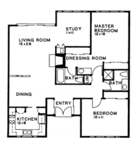
Plan B 2 Bedroom, 2 Bath and Den 1469 sq. ft.