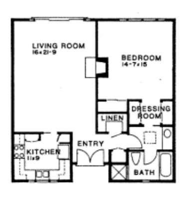
Plan D 1 Bedroom, 1 Bath 1000 sq. ft.