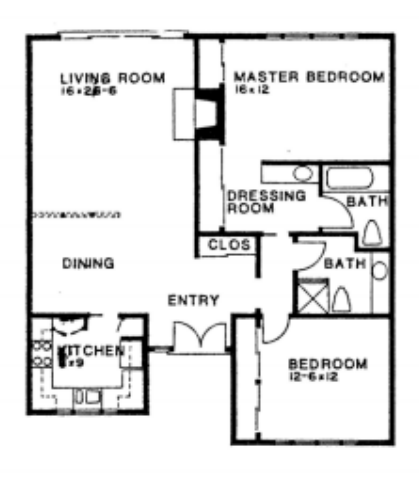
Plan A 2 Bedroom, 2 Bath 1317 sq. ft.