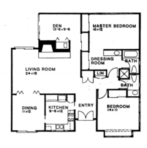
Plan C 2 Bedroom, 2 Bath, Den and Dining Room 1600 sq. ft.